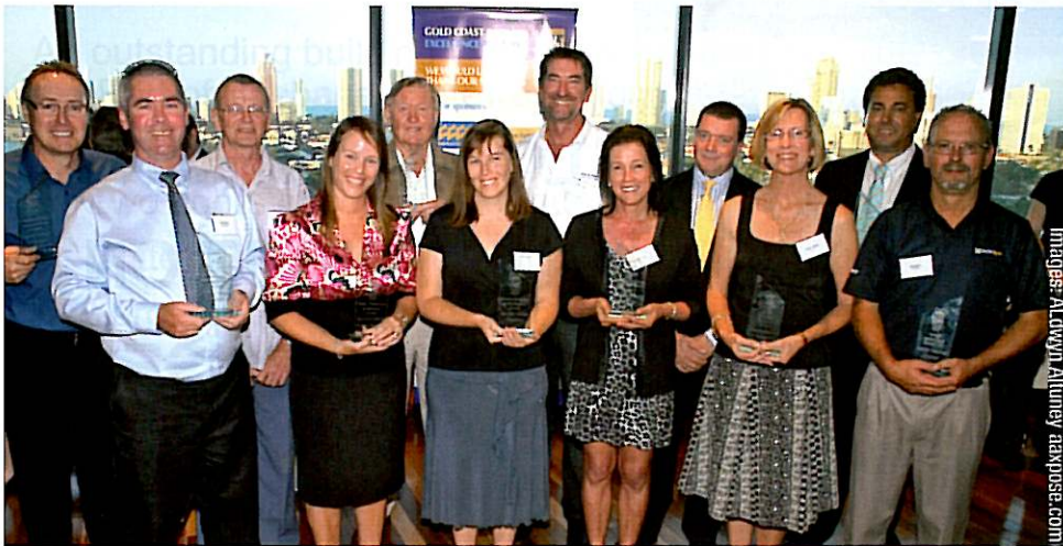
The October Gold Coast Business Excellence Awards winners celebrate.